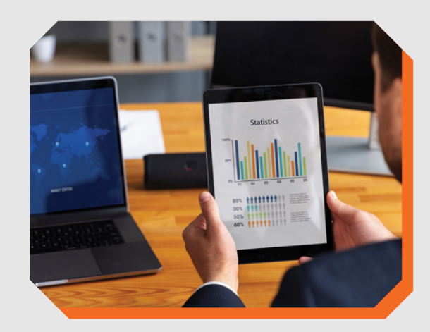
Committed to providing best-in-class financial solutions with flexibility, efficiency, and accuracy

Experienced professionals with expertise in financial services and a strong understanding of the USA/Canada business and regulatory environments. We have US CPA's in our team, to perform specialized work, as well as to do certifications, were needed.