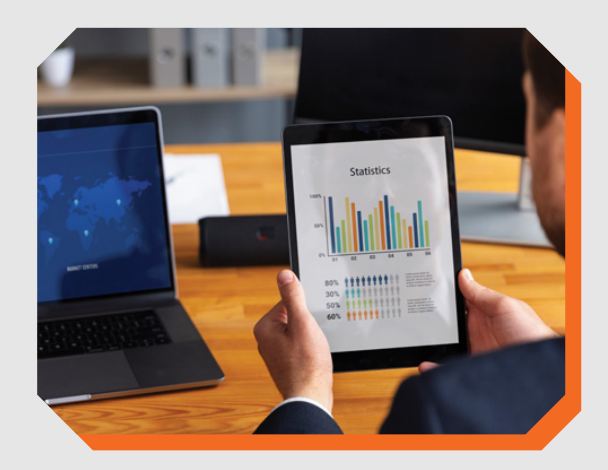
Committed to providing best-in-class financial solutions with flexibility, efficiency, and accuracy

Experienced professionals with expertise in financial services and a strong understanding of the Australian business and regulatory environments